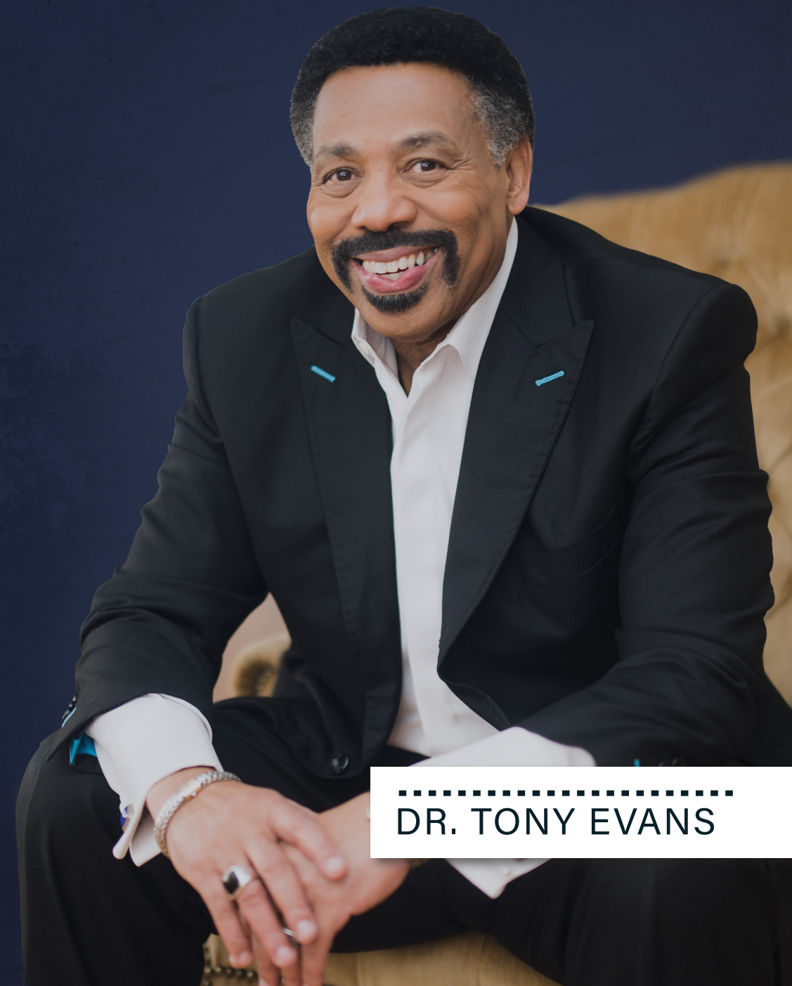
..... DR. TONY EVANS

We need more than a protest. We need a plan.