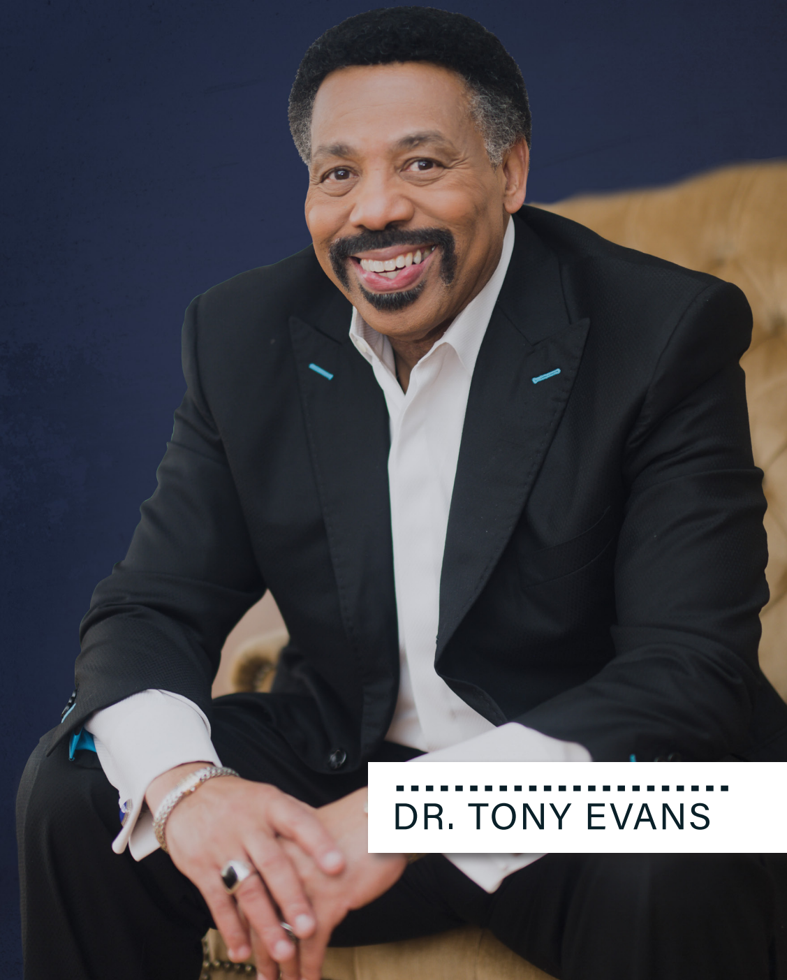
..... DR. TONY EVANS

We need more than a protest. We need a plan.